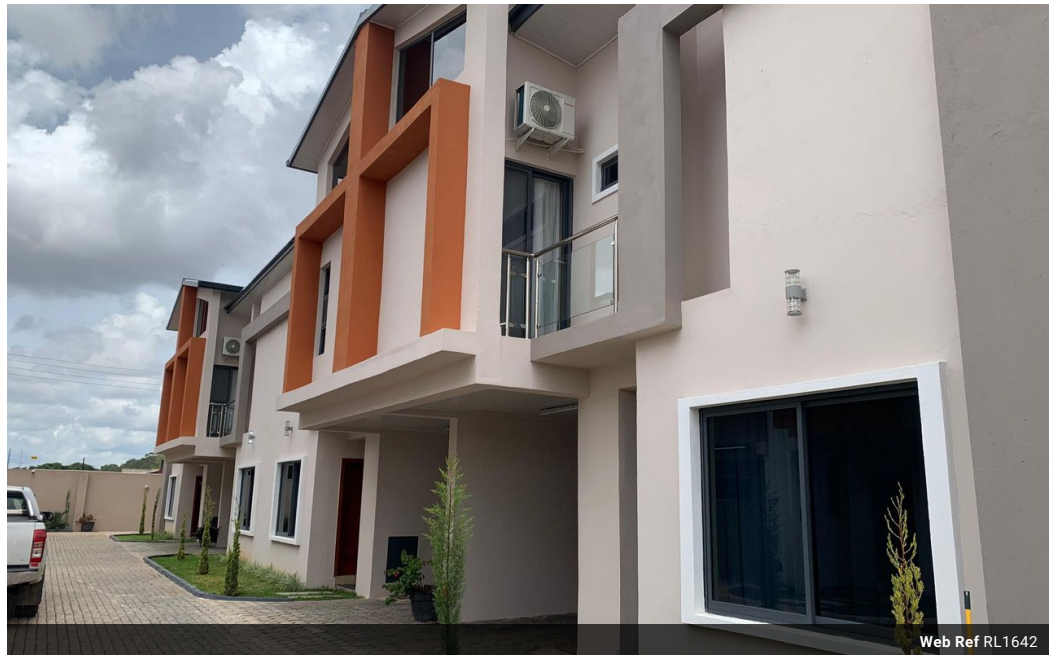
Web Ref RL1642

Foxdale Court 114 1st Floor, Second Building 609 Zambezi Road Roma Lusaka 10101