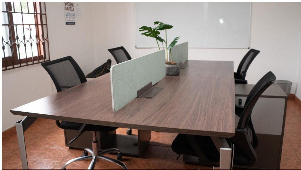
Web Ref CL222

Foxdale Court 114 1st Floor, Second Building 609 Zambezi Road Roma Lusaka 10101